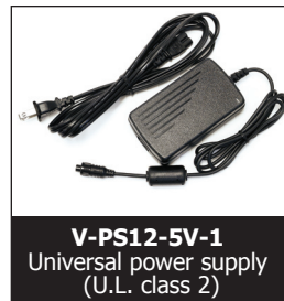
V-PS12-5V-1 Universal power supply (U.L. class 2)